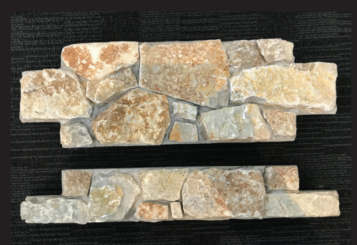
600 X 200MM AND 600 X 100MM ½ PANELS